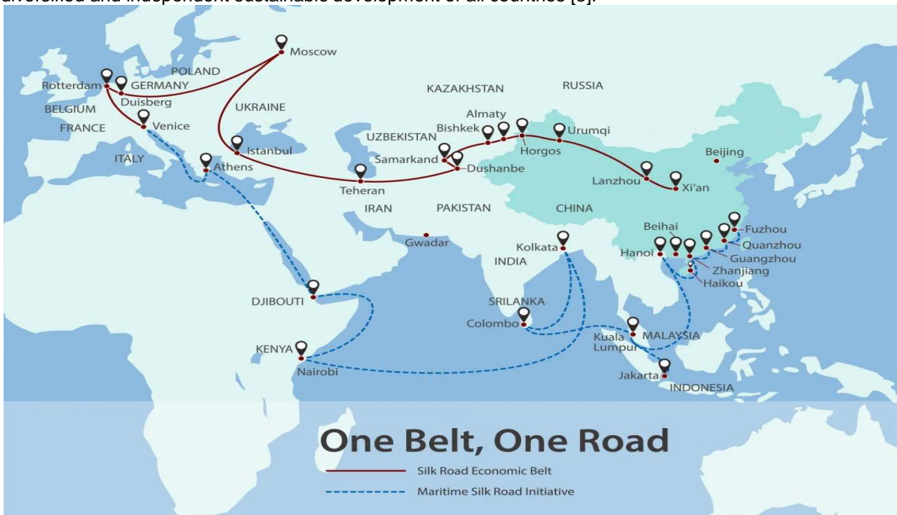
Fig. 1. The Map of "Belt and Road Initiative"

The "Belt and Road" initiative is an international cooperation project to enhance the connectivity and mutually beneficial cooperation between the Eurasian and African continents and its adjacent waters. The "Belt and Road" refers to the abbreviation of the "Silk Road Economic Belt" and "21st Century Maritime Silk Road". As shown in Fig.1, The "Belt and Road" runs through Eurasia, connects the Asia-Pacific Economic Circle in the east, and enters the European Economic Circle in the west. It aims to promote the balanced, diversified and independent sustainable development of all countries [3].